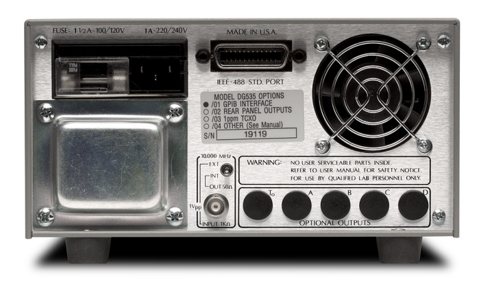
DG535 rear panel (with Opt. 02)