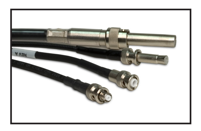
High voltage cables

Operation is simple. The parameter being adjusted or set is displayed separately and can be entered without affecting the actual output voltage. Up to nine instrument configurations can be stored and recalled at any time, making it easy to run multiple tests.