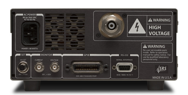
PS370 rear panel

Both GPIB and RS-232 computer interfaces are standard on all 10 W supplies. GPIB is available as an option on the 25 W instruments. All parameters can be set and read via the computer interfaces.