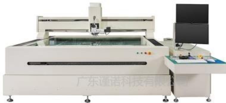
Automatic tool metallographic measuring instrument V2000