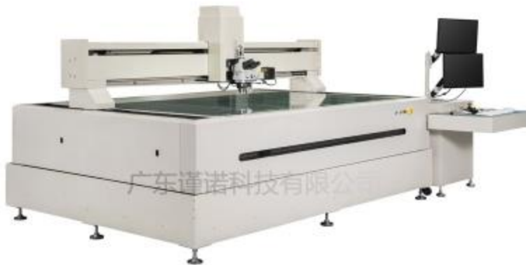
Automatic tool metallographic measuring instrument V800