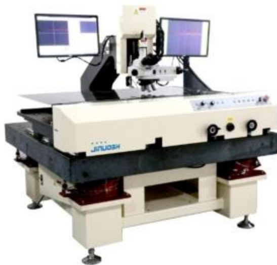
Automatic tool metallographic measuring instrument V400