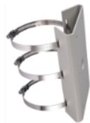
DS-1275ZJ-SUS Vertical pole mount