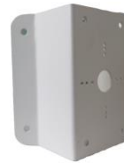
DS-1276ZJ-SUS Corner mount