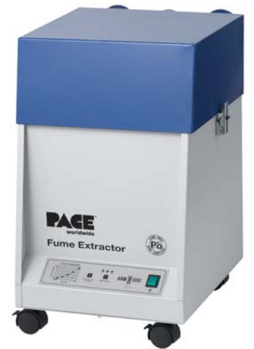
See page 7 for replacement filters. See pages 8 and 9 for additional accessories.

* Airflow and noise level are nominal numbers and will vary based on voltage