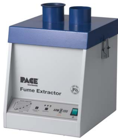
See page 7 for replacement filters. See pages 8 and 9 for additional accessories.