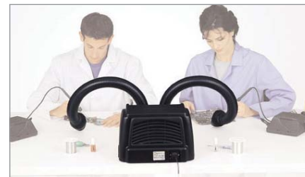
Providing fume extraction to two workstations