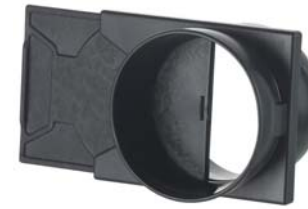
Part Number: 8886-0795-P1

The Air Flow Controller for the 75mm (3") ESD Safe Flex-Arm gives the user complete control over the fume extraction air flow at their work bench. It is infinitely adjustable from fully-closed to fully-open to precisely deliver the ideal airflow needed to protect workers' health and eliminate any excessive air flow that could cool the solder/reflow work area.