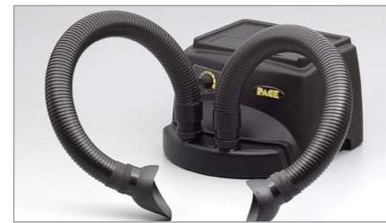
Arm-Evac 50 with optional Dual Arm Attachment