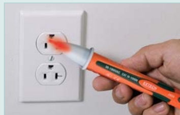
Quickly check for the presence of live wires before testing