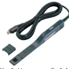
Handheld sensor specifically for blue-violet optical lasers