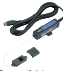
Sensor specifically for blue-violet optical lasers (detachable model)