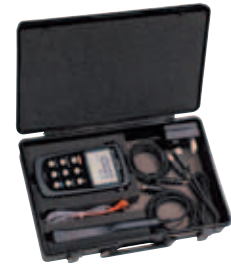
Handy for travel and storage

Optical Power Meters installed with firmware version 1.01 or earlier must be updated to support compatibility with the new Optical Sensor 9743/ 9743-10